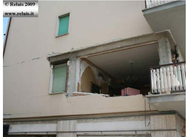
Reinforced concrete building placed in Via XX Settembre – L'Aquila Total and partial ejecting of corner infills at first level.