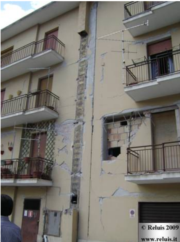
Infills damage Partial ejecting of external infill, made up of solid bricks. The separation joint, large about 2 cm, and collapse of clay blocks flue are clearly shown.