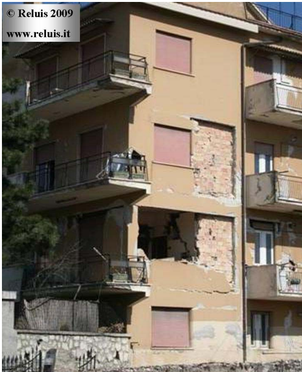
Infills damage: four stories R.C. building External infills ejecting at the second and third levels.