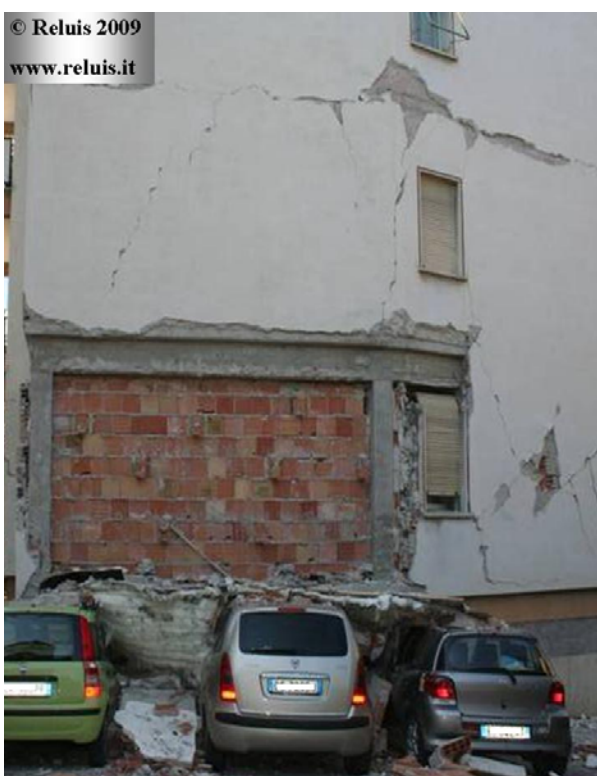
Infills damage Double clay block infill. External infill ejecting, ruined on cars beneath.