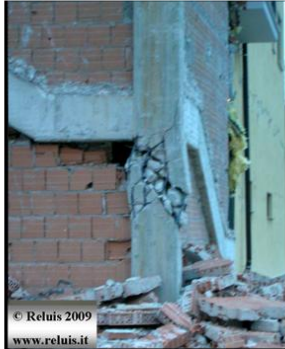
Stairs damage Shear failure of a short column in the staircase.