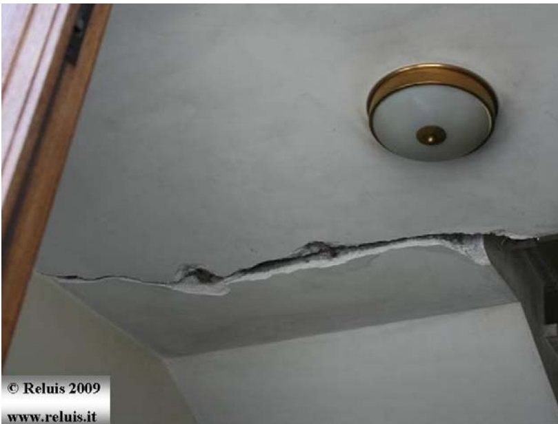
Stairs damage Wide crack between stair slab and last step.