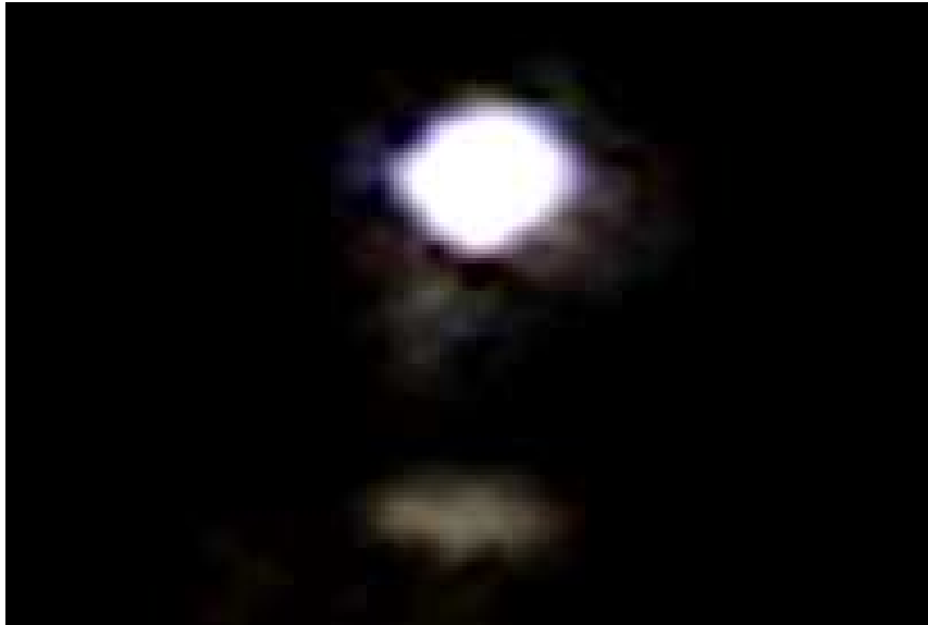
Fig. 2. A luminous sphere observed at 01:53 LT on 22 February 2009, near Preturo.