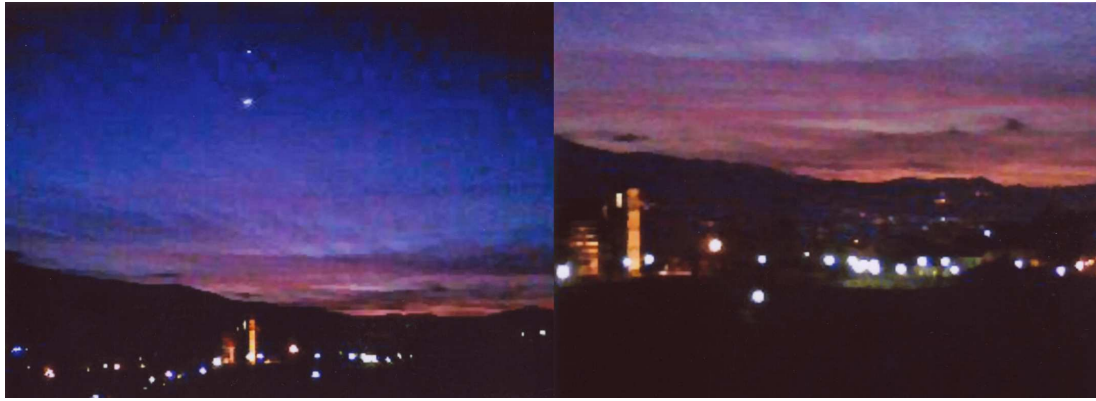
Fig. 1. Reddish diffused light photos from Poggio Picenze towards Aquila (WNW) at about 22:30 LT on 5 April 2009.

coloured luminosity. All testimonials described the colour as being brighter over the mountain crests. Some photos were taken from the village of Poggio Picenze at about 22:30 LT on 5 April in the direction of Aquila just before the 22:48, M=4.2 foreshock. In the left photo of Fig. 1, the Moon and Saturn appear in positions that confirm this date and time. These photos are grainy as they were taken with a SAMSUNG SGH i320 mobile telephone camera. Giorgia Zenadocchio affirmed that after the main shock the sky was still reddish from Pettino toward the Velino-Sirente mountain range, the light shone from the profile of the mountains and was nuanced. The phenomenon lasted until daybreak, the light was similar to that of the lights at local motorway junction, that is, the colour orange.